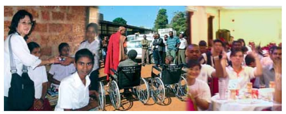
Helping the Untouchables